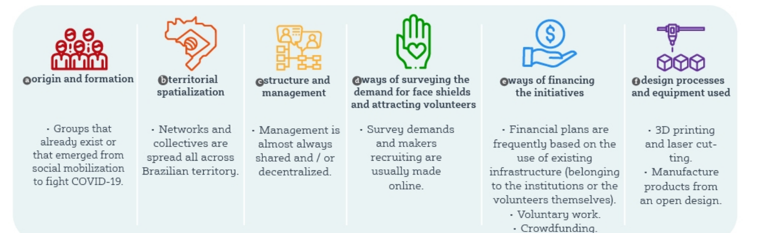
Figure 3. Modus operandi of the networks and/or collectives in Brazil.