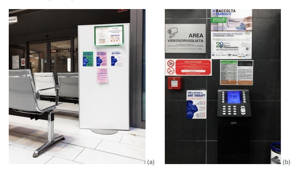
Figure 1. Knit therapy promotional campaign, hospital Papa Giovanni XXIII, Bergamo, February 2020.

4. Training (where the designer trained the operators to make them autonomous on a long term prevision).