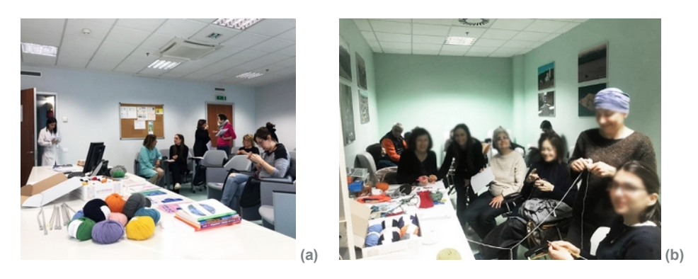
Figure 3. Knit therapy workshops, hospital Papa Giovanni XXIII, February 2020: (a) some attendants are already knitting/crocheting, while others are filling in the pre-activity survey (b) session with patients and visitors in the waiting room of the Oncology ward.

In general, the workshop structure and execution were successful: the initial introduction which then continued into a friendly discussion while knitting presented effectively and reliably the benefits studied in literature. The workshop was also a moment of social bonding, and the exchange of knowledge among the participants allowed new perspectives to take shape (Fig. 3).