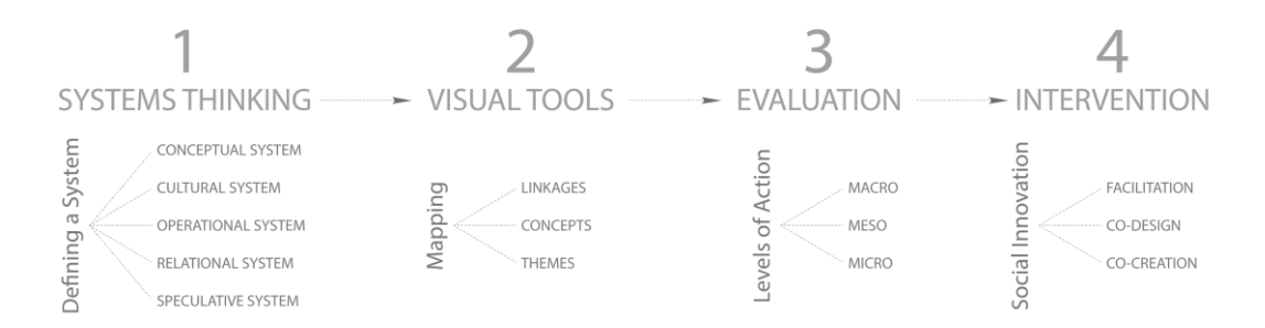
Figure 2. Systems Thinking for Social Innovation

Systems serve as explanations for complexities and a successful systems design is able to be decomposed, simplified, or approximated by linearisation (Norman and Stappers, 2015). Understanding the abstraction of problems through a system is a necessary precondition to developing frameworks, models and processes for future actions. As systems provide an understanding of ways of life, by containing all existing things and relationships, it conceptualises and articulates the problems spaces for future design enhancements. The discussion of the case-study has presented a systems thinking methodology within the scope of social design.