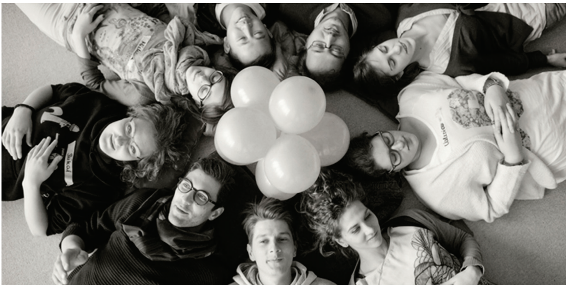
Figure 2. InResidence-Design Dialogues (2010), edited by Marco Rainò and Barbara Brondi, workshops, Du Parc Residence, Turin. In these selected images there are some conceptual laboratories that use a series of unusual experimentations in order to draw reflections on the project and on the role of design. Available at: http://inresidence.it/projects/ . Accessed on: 10/01/2014.

The web is the only life experience. This coexistence of things which are extremely physical and digital at the same time leads us to a new point of view on the material practices of contemporary design. Incapable of explaining in words the profound transformation that our world is experiencing more and more frequently, designers express their thoughts through reinvented materials, interactive mechanisms, the use of hybrid digital-natural tools, homemade instruments. All of these are just a small part of the research practices that many well-known studies by emerging designers are adopting to communicate their critical point of view about the world. In an organic vision of the union between the digital and the physical, man, even while connecting to the world and absorbing electronic sensors, still stays on a different, not computable level, based on a deep and ancestral relationship with things. At the centre of this infinite exchange and beyond every limit of people, data, ideas, in fact, a special place for a new, bold experimenta-