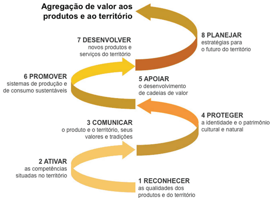
Figure 1. Examples of design actions can contribute to innovation applied to territory (source: Krucken, 2009).