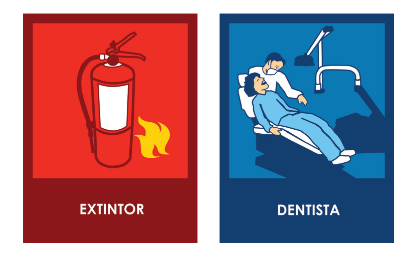
Figure 2. Pictograms.