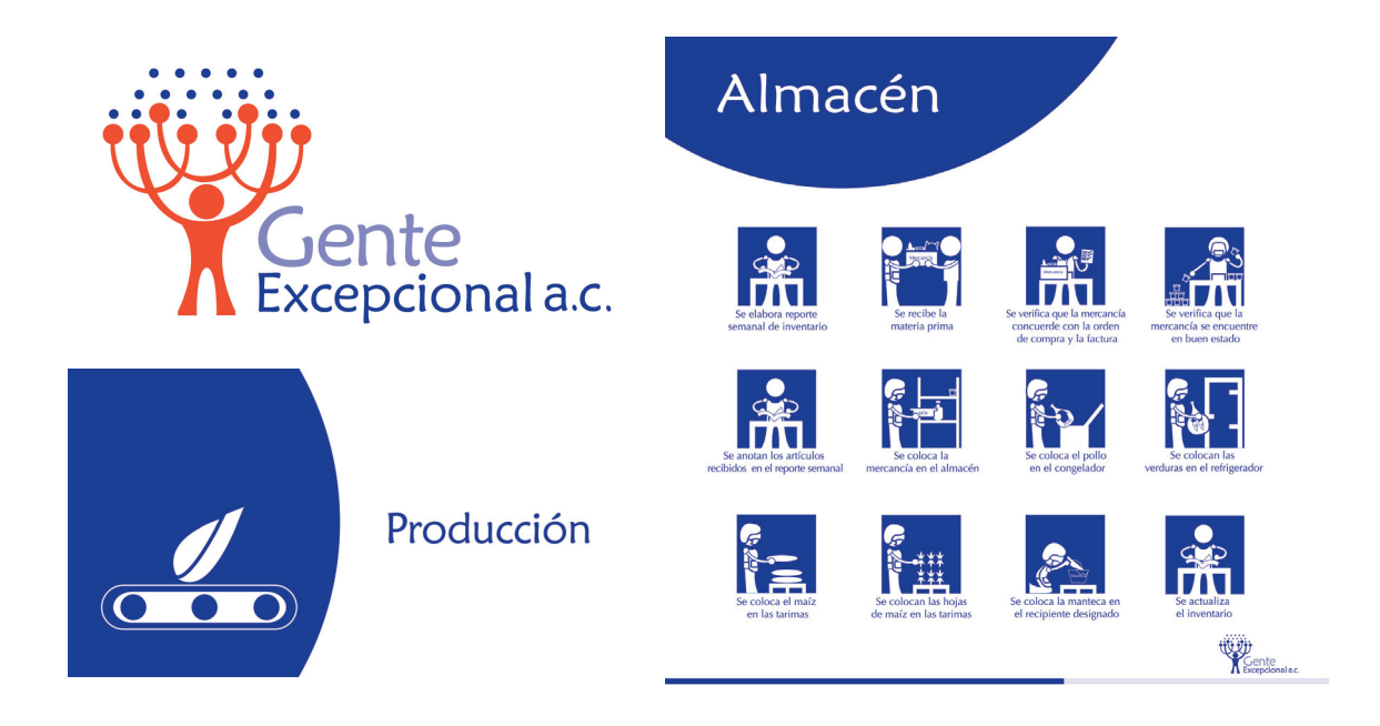
Figure 3. Gente Excepcional logo.

The signalectic system designed shows the "man tree" (taken from the corporative image of GE), whom is represented performing different actions to signalize them (this is the reason for its arms being longer than its trunk). The final measure of the basic GE symbol was obtained from the proxemic formula ( S = L^2 / 2000 ), being the dimensions obtained of 24 cm x 24 cm. However, as the proposed use for this signage corresponded to a horizontal format, it was dimensioned again according to the golden section, resulting in its final magnitude of 44.7 cm x 24 cm.