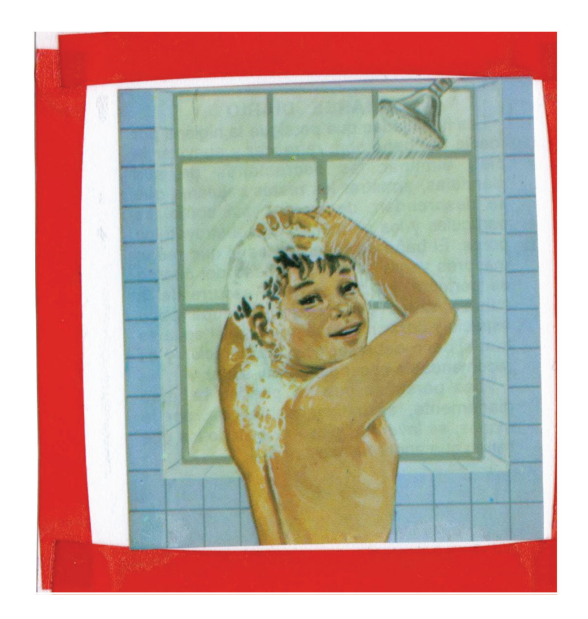
Figure 1. Posters formed by visual keys.