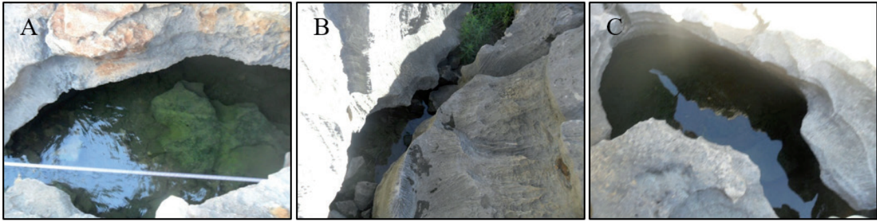
Figure 2. Collecting sites of Hypsolebias antenori : pools formed during the rainy season in dolines (A and C) and in fissures (B) located in small canyons of the Lajedo de Soledade, Apodi-Mossoró River Basin, Apodi municipality, Rio Grande do Norte, northeastern Brazil.