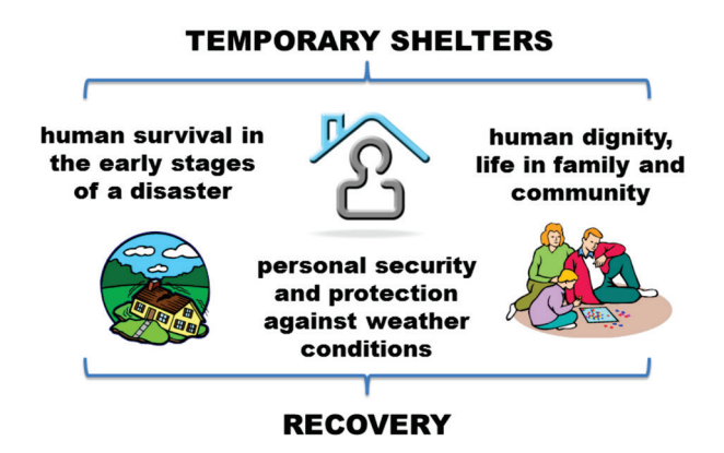
Figure 1. Temporary shelters – recovery from the consequences of the disaster.

According to Nappi and Souza (2015), the lack of criteria regarding planning and stablishing temporary shelters may lead to unpredictable factors. Often, decisions on the matter are only taken after a catastrophic event, when there is not sufficient time for a thorough reflection on the essential rules that should lead choosing and building temporary shelters (Omidvar et al. , 2013).