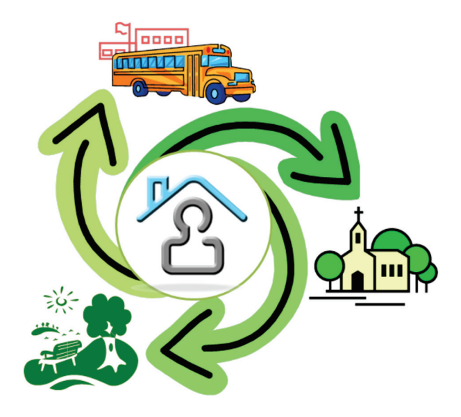
Figure 3. Easy and secure access.

(a) The temporary shelter must have vast living areas adequate to the total number of users, as well as